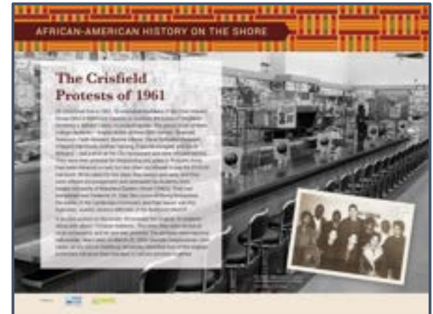
Eastern Shore Civil Rights storytelling sign